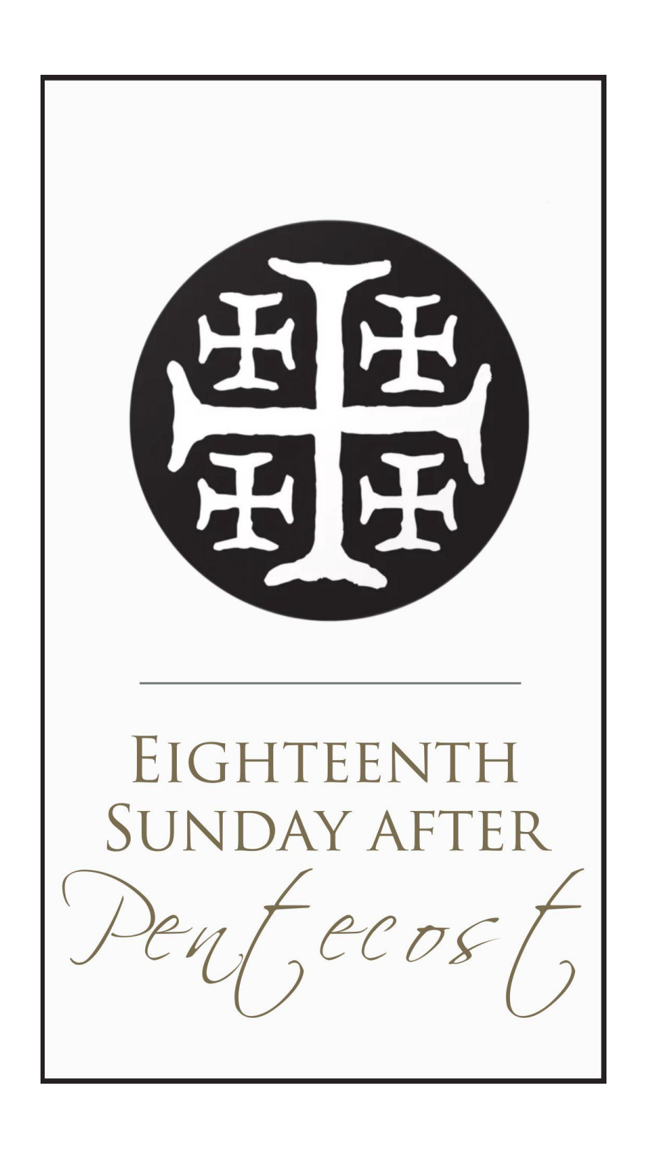
Episcopal Church of the Ascension September 22, 2024 | 10:30 a.m.